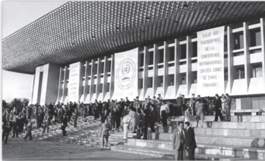
Lenin Convention Center in Alma-Ata, where the 1978 International Conference on Primary Health Care took place.